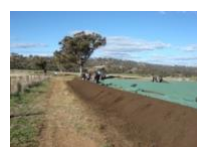
composting facility Australia