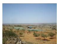
composting facility Kenya