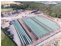
composting facility Austria