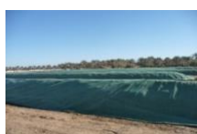
composting facility Royal Court Oman