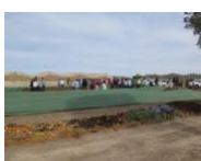
composting facility Spain