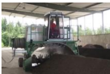
indoor composting facility Germany

Fax 0043 – 7276 – 3618 13 Phone 0043 – 7276 – 3618 Email office@landmanagement.net www.landmanagement.net